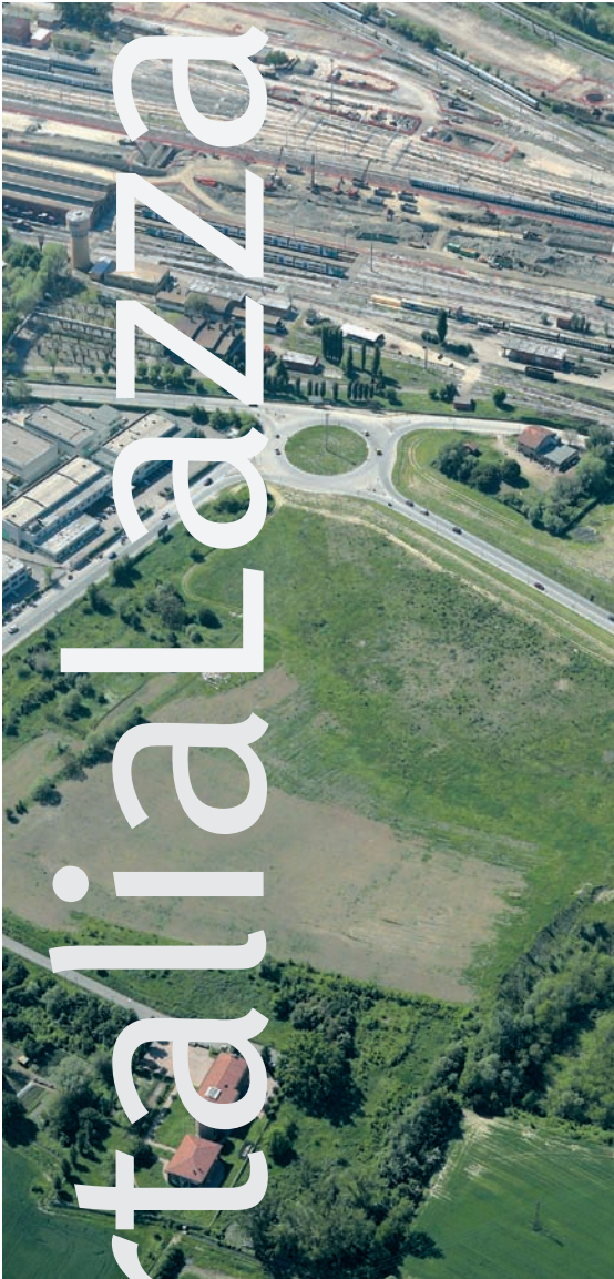
Immagine Terraltaly TM-© Compagnia Generale Riprese Aeree S.p.A. - Parma