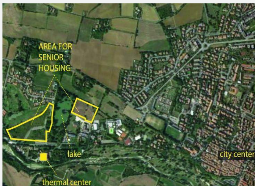
Site map from Google map