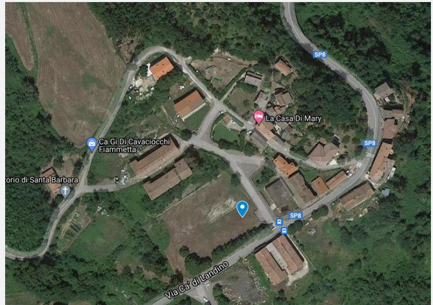
Area localization on Google map

The area has been urbanized thanks to public funding.