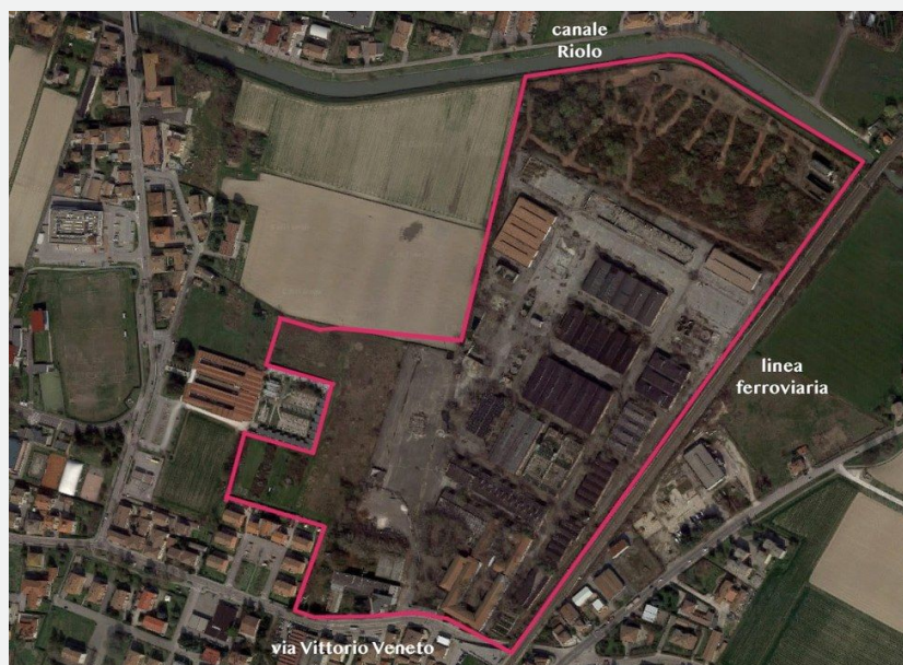
Site map from Google map