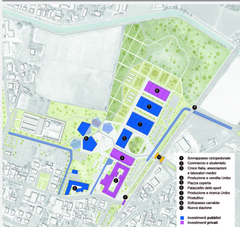
Masterplan. Private investments in purple, public investments in blue.