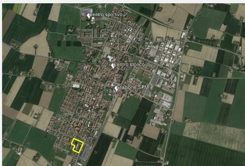
Site map from Google map