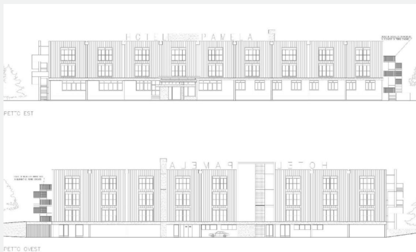
Fronts of the existing building

In addition to the hotel function, it is possible to realize: collective and social health residences (nursing homes, rest homes, protected residences, day centers,) public businesses and restaurants, game rooms, sports, cultural and public entertainment activities generally.