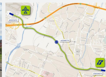
The People Mover