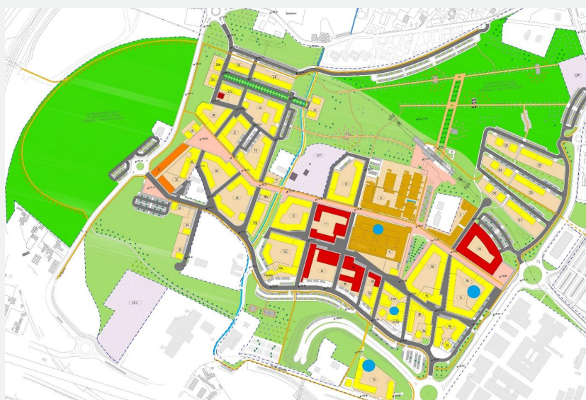
Masterplan of the Lazzaretto area

In the area are located many greenfield lots to be developed for residential, student and senior housing.