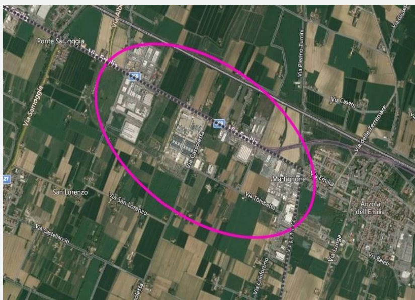
Location of the area on Google map

The area is characterized by its privileged position, easy railway, highway, and airport connections, and a highly developed productive system. The Martignone area is equipped to host functions such as manufacturing, craftsmanship, industry, and other related functions. To date, there are 175 already established companies, about half of which belong to the manufacturing sector, including companies in the metalworking sector. In particular, two of the most important leading companies in the Bologna Packaging Valley are located in the Martignone area.