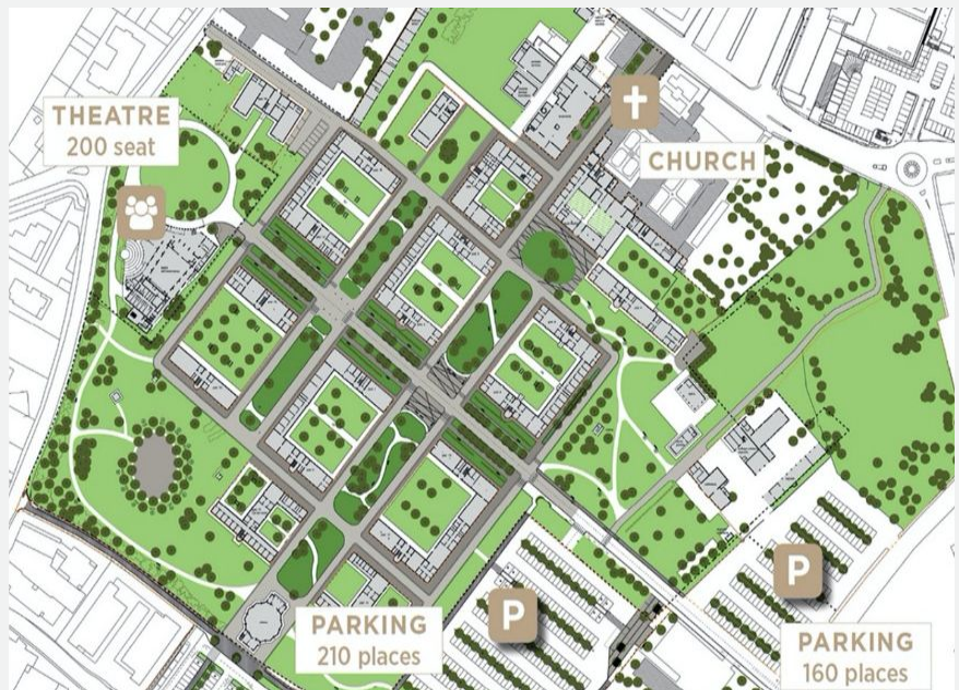
Masterplan of the area