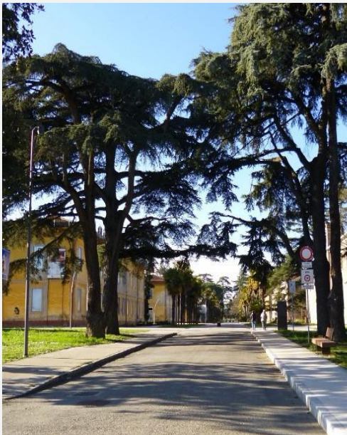
Main avenue image