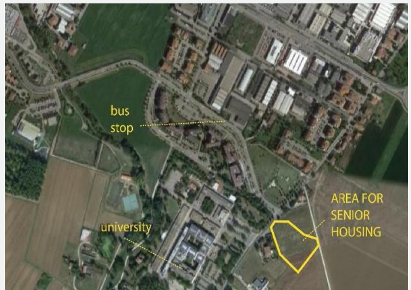
Site map from Google map