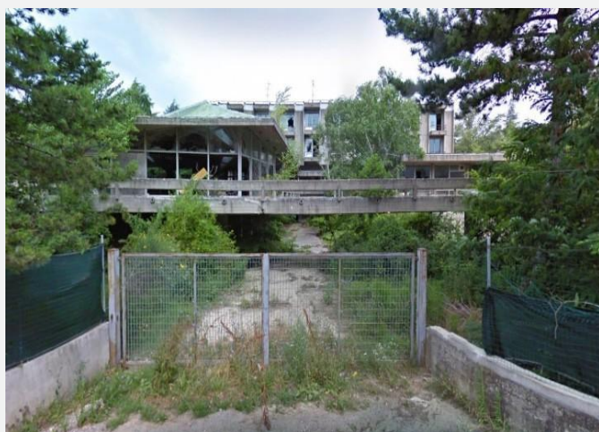
Picture of the building