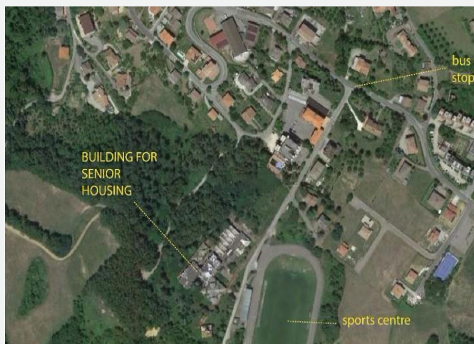
Site map from Google map