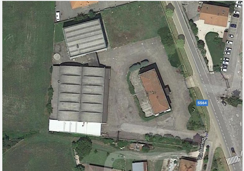
Area localization on Google map

Considering the proximity of the area to the urban centre, it is suitable for hosting not only productive functions but also services. The area is equipped with a broadband internet infrastructure of more than 30 Mb.